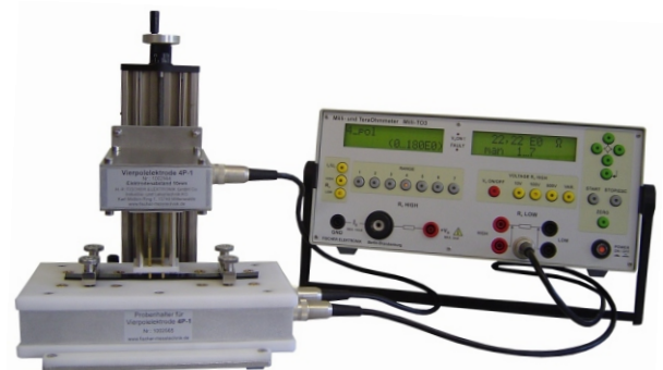
4P-1 with Milli-TO 3 (optional)

The specimen holder also can be employed for high ohm measuring, in connection with a tera-ohmmeter at unexpected measured values or measuring overranging in the highest measurement range.