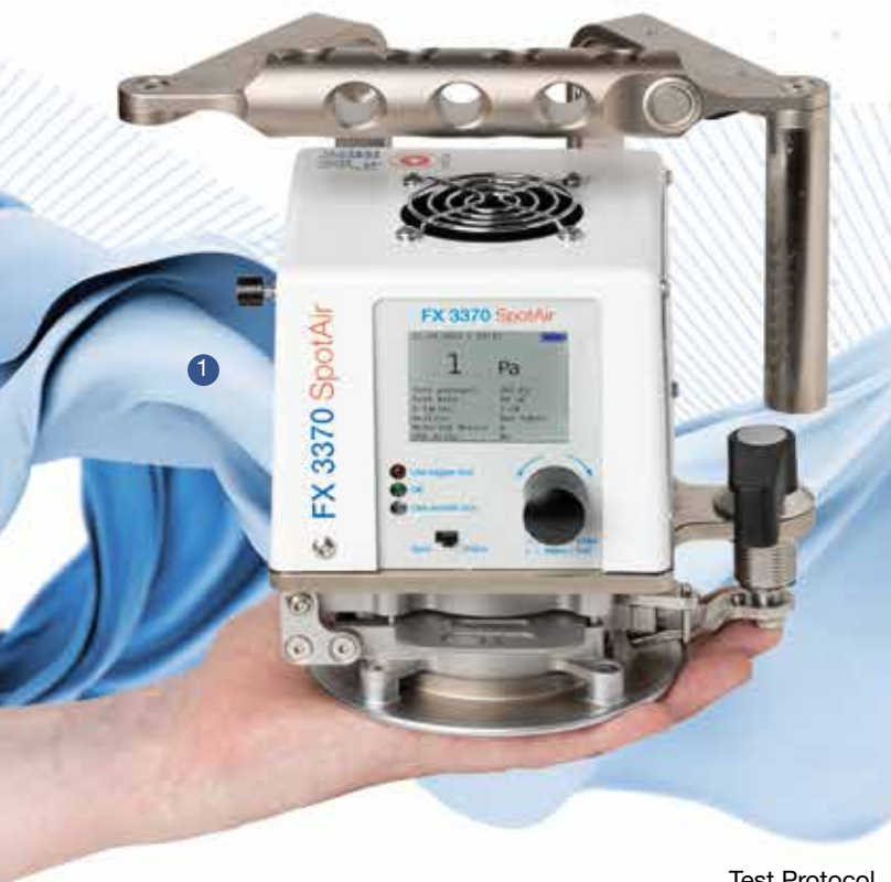
Test Protocol FX 3370 SpotAir

The supplied carrying case not only allows to move the instrument easily and safely within a plant, it also assists when it needs to be taken to a supplier or customer for measurements there.